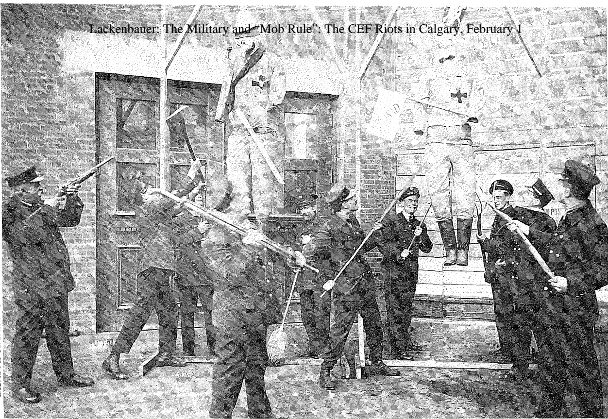
In this staged photograph, Calgary firemen attack effigies of German soldiers.