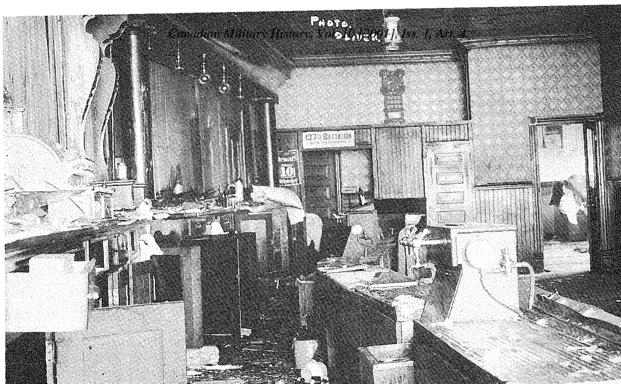
The bar area of the Riverside Hotel following its destruction by the mob.