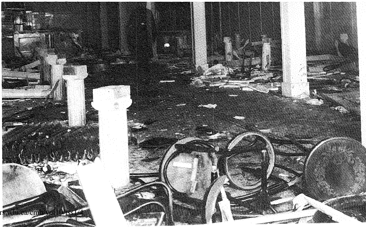
Post-riot photo of the White Lunch Restaurant.