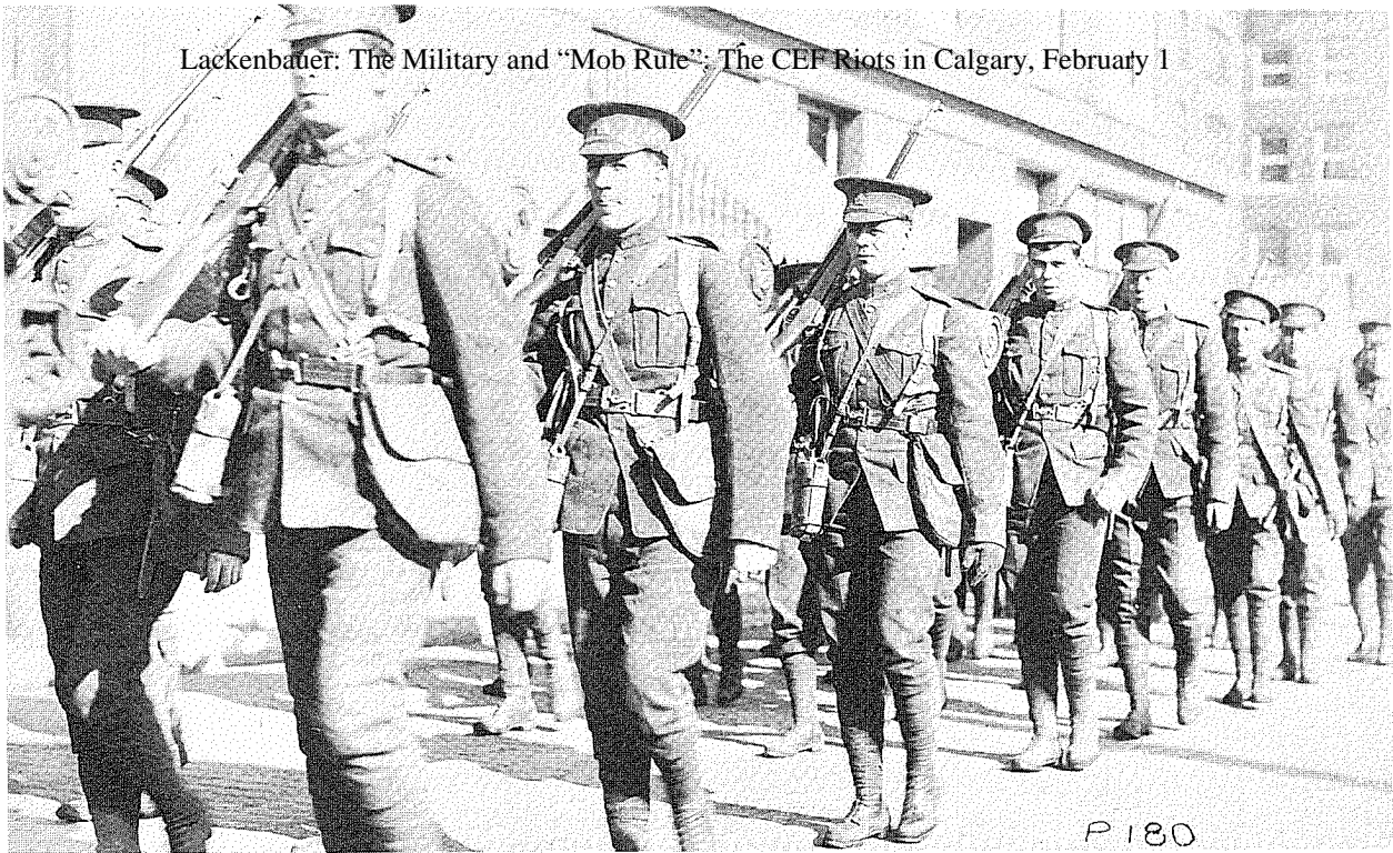
Soldiers from the 50th Battalion marching through the streets of Calgary.