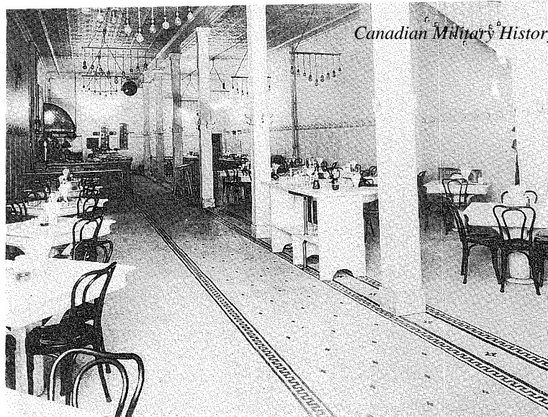
Glenbow Archives NA-1469-51